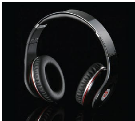
PHOTO 1: Ammunition Group Beats by Dr. Dre headphones (Monster Cable).

Recent Ammunition Group projects include the Dr. Dre headset for Beats (by Monster) ( Photo 1 ), and a soon-to-be-introduced state-of-the-art LCD TV. Recent developments include expansion into branding and corporate identity—aspects of this include market position strategy, logos, trade show booths, the look of the advertisements, and so on. Visit www.ammunitiongroup.com —you will recognize more than a few awesome products.