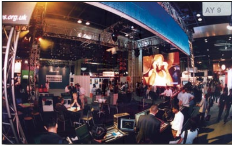
Exhibitors were creative in their display designs for PALA 2005, hoping to get visitors' attention.

The Vibes ClubFest 2005 was a new initiative held in conjunction with PALA 2005 and attracted more than 5000 party-goers to Hall 603, where Suntec was transformed into a two-night indoor entertainment event that was the largest party of its kind. Several of the world's leading manufacturers of professional